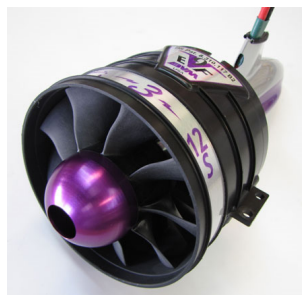
EVF ~3~ 12S