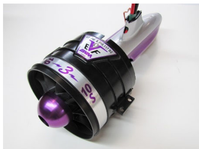
EVF ~3~ 10S

Optimally designed inlet and tailpipe systems, such as those on a BVM sport jet will allow installed static thrusts of 1.5 to 2.0 lbs below the bench numbers. Some well designed, but scale inlet systems will suffer a bit more loss in the static condition. However, if the design is proper, the pressure recovery will be significant as the model accelerates.