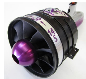
EVF ~3~ 14S